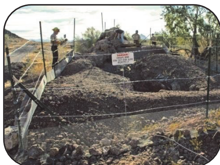
Fence, Imperial Co.