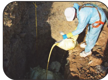
PUF closure in progress, Inyo Co.