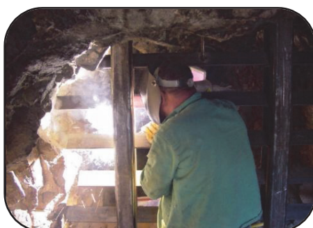
Bat gate in progress, Riverside Co.