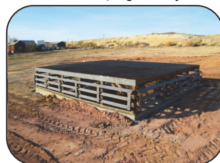
Bat cupola, Kern Co.