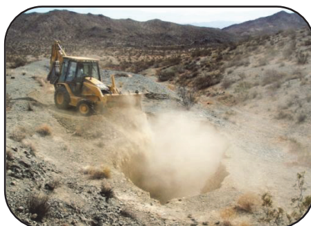
Backfill, San Bernardino Co.