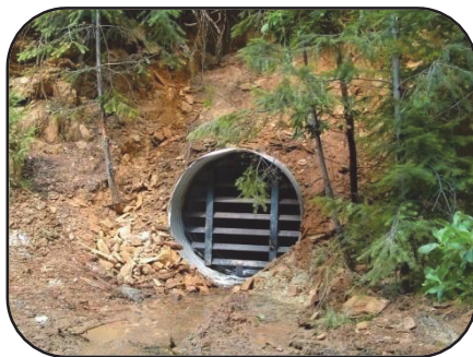
Culvert gate, El Dorado Co.